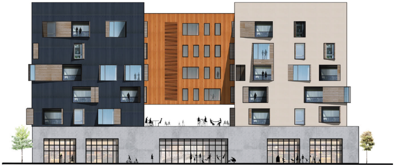
Concept drawing provided by petitioner.