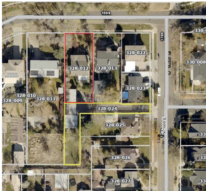
Figure 1: Salt Lake County Parcel Map.

While identified as a distinct parcel in County records, Salt Lake City does not recognize the Property as such. The Subject Property is adjacent to another property owned by the Applicant (the “Blaine Property”). The Blaine Property is a .21-acre lot with a duplex. For purposes of land-use designation Salt Lake City considers the Subject Property and the Blaine Property to be one cohesive lot. Both Properties are depicted in Figure 1 .