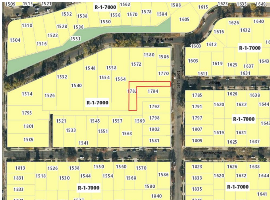
Zoning Map of the Subject Neighborhood

The subject property is an illegal lot created through a nonapproved subdivision. This means that a prior property owner recorded deeds subdividing the property without ensuring the property met the zoning requirements for a subdivision and without a subdivision amendment. The property history which is extensively discussed in a published administrative interpretation from 2020, outlines the history of the property. The determination relied on the prior Board of Adjustment decisions that identified the subject property as part of 1572 E Blaine Avenue. The full Administrative Interpretation can be accessed in the provided link, below. The applicant appealed the Administrative Interpretation to the Appeals Hearing Officer. The Appeals Hearing Officer agreed that the lot was illegally subdivided and upheld the Administrative Interpretation. The Appeals Hearing Officer decision can be accessed in the provided link, below. Due to the outcome of the Appeals Hearing, the applicant determined that the alternative route is to amend the zoning map and future land use map in order to pursue the construction of a single-family residence. It should be noted that the requested amendments do not legalize the subdivision of the subject property, nor make this property a buildable lot.