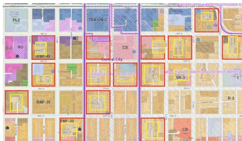
Figure 3: SR-3 Interior Block Examples Shown in Yellow

Thankfully the applicant has identified a city zoning designation that seems to address this exact exceptional situation. The SR-3 special pattern residential provides for lot, bulk and use regulations, including a variety of housing types, in scale with the character of development located within the interior portions of city blocks. This zone has been used liberally in the city to provide land-use to uniquely located properties where use of the surrounding zoning restrictions would render a site undevelopable.