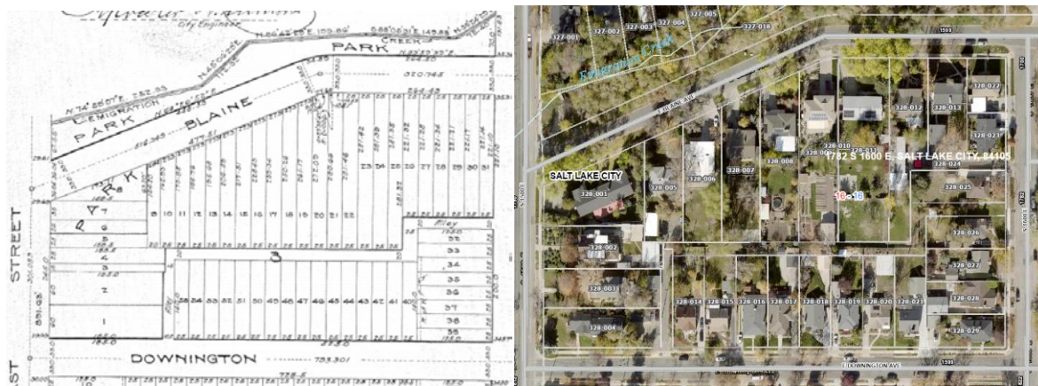
Figure 2: Portion of Progress Heights Second Addition Plat contrasted with current site condition.

The Progress Heights Second Addition subdivision is more than 70 years old, and its current lot configuration has changed immensely since its initial subdivision. While the plat has never been formally amended, lots have been combined and a midblock alleys have been vacated in what surprisingly has resulted in a fairly typical neighborhood residential pattern.