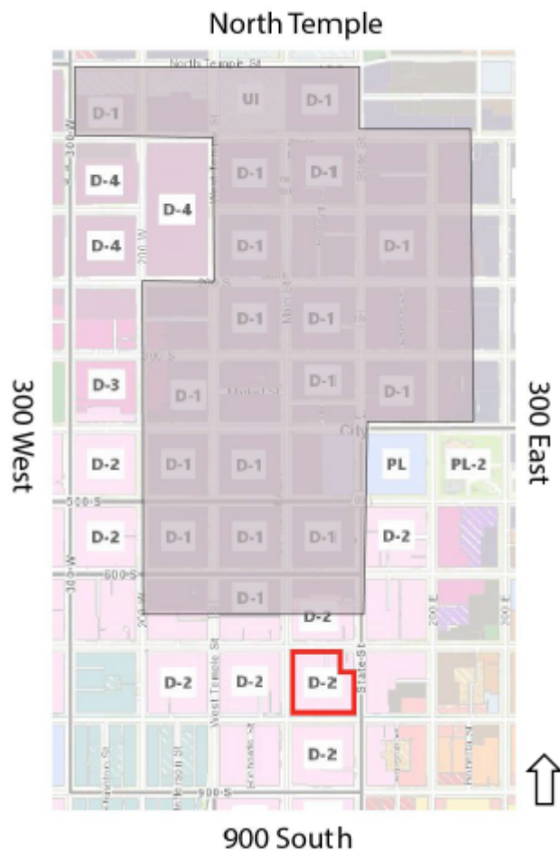
Area zoning map with subject property outlined in red.