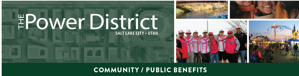
EXHIBIT F [Community Statement]

Larry H. Miller Real Estate's commitment to the Power District on the west side of Salt Lake City includes: