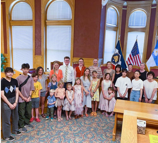
Students visiting SLC City and County Building from Matsumoto, Japan