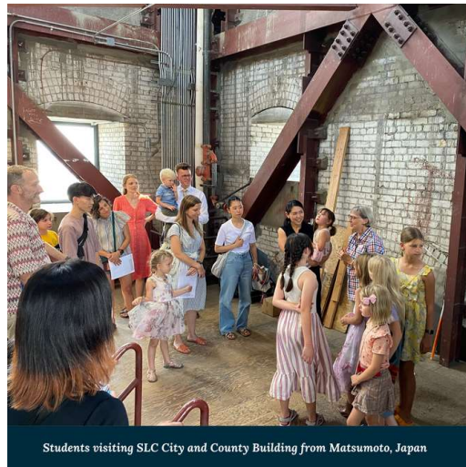
Students visiting SLC City and County Building from Matsumoto, Japan