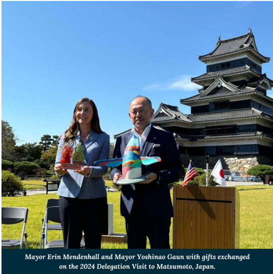
Mayor Erin Mendenhall and Mayor Yoshinao Gaun with gifts exchanged on the 2024 Delegation Visit to Matsumoto, Japan.

The formal visit to Matsumoto was roughly three and a half days. On the first day, the delegation met with Mayor Gaun and Council Chair Kamijo and their staff, and Mayor Mendenhall gifted a miniature-scale version of the 9th and 9th whale to Mayor Gaun. The group toured Matsumoto Castle, the Matsumoto Performing Arts Centre, and visited their beautiful new City Museum. On the second day, the group toured a miso factory, Matsumoto Brewery, the Matsumoto City Museum of Art, tried on traditional Japanese kimonos, and sang karaoke together. On the final day, Mayor Mendenhall delivered a speech about women in leadership to a group of middle and high school students, along with the mayor and other officials.