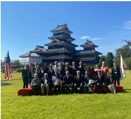
2024 Delegation Visit to Matsumoto, Japan