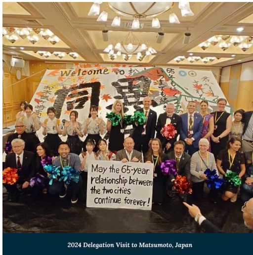
2024 Delegation Visit to Matsumoto, Japan