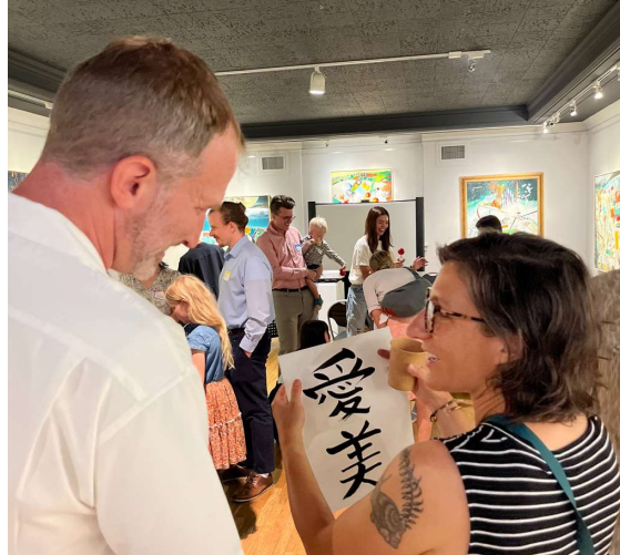
Dinner and presentation at the Finch Lane Gallery with students visiting from Matsumoto, Japan