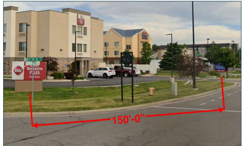
(Two monument signs in the M-1 District separated by approximately 150 feet)