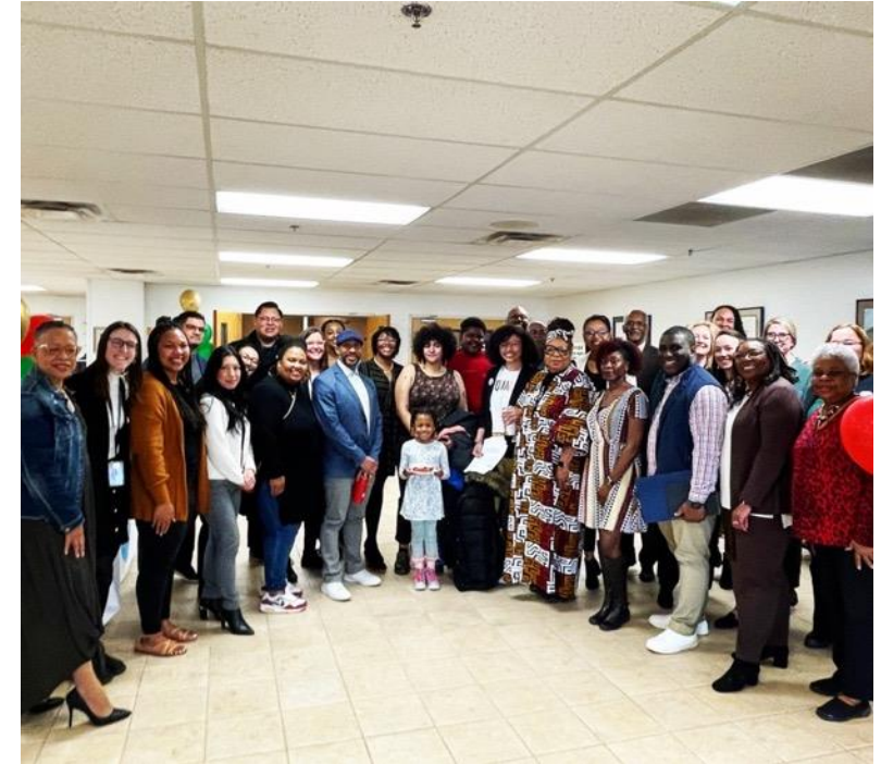
"Black & African American Leader Service" hosted at Calvary Baptist Church 2023 BHM ACM pictured.

The Mayor's Office Community Outreach Team has hosted this inclusion-focused event to build the relationship with city officials and staff. It is one of 8 annual connections to minoritized communities. The goal is to have tough conversations and connect community, their leaders, business owners, residents, artists and activists to staff to fill any gaps in service when possible.